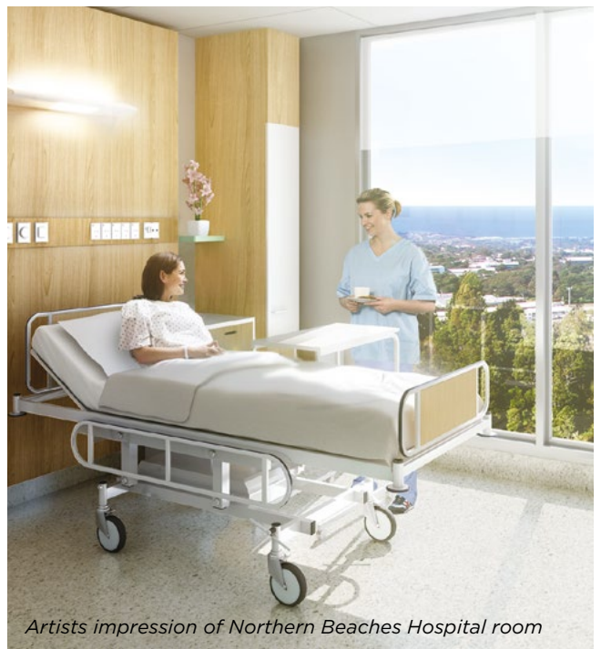
Artists impression of Northern Beaches Hospital room