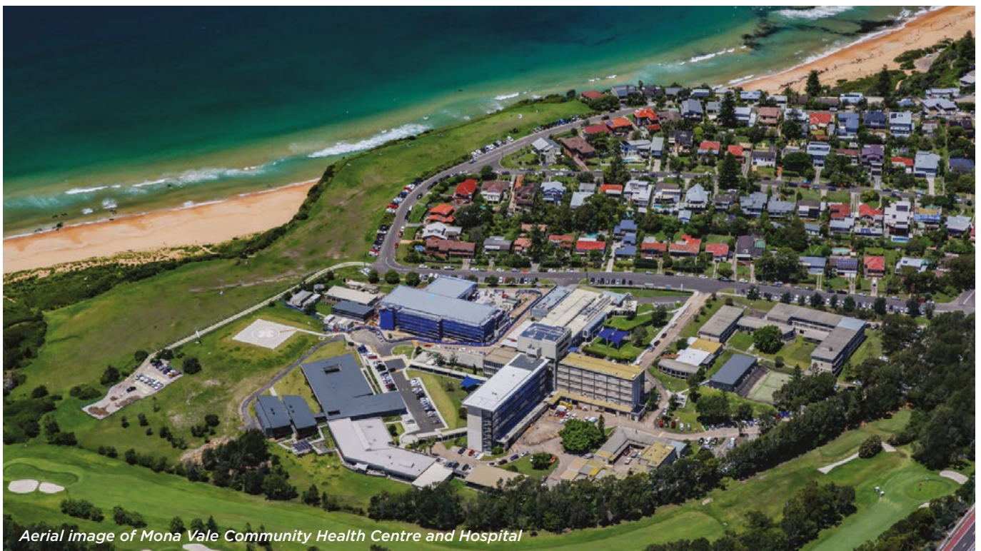
Aerial image of Mona Vale Community Health Centre and Hospital

The Brookvale Community Health Centre will be a major hub for services including mental health, community nursing, drug and alcohol counselling as well as providing a permanent home for BreastScreen NSW.