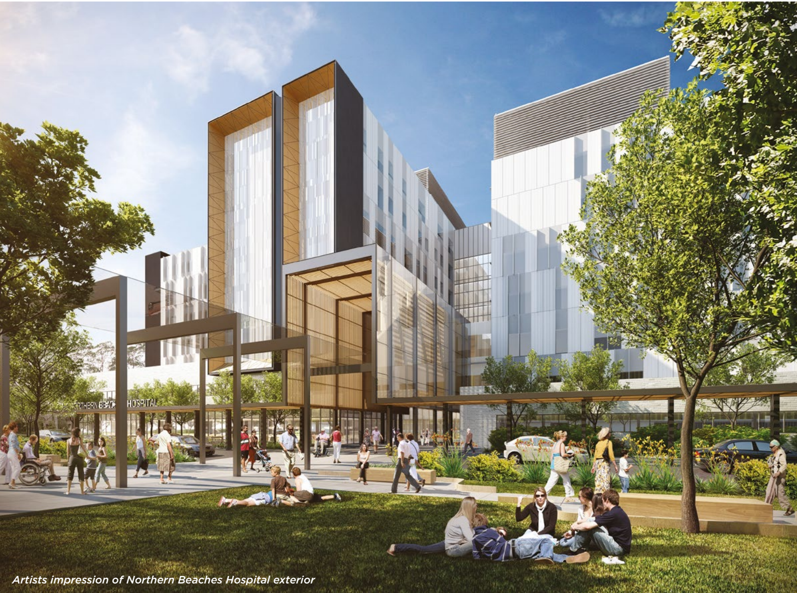
Artists impression of Northern Beaches Hospital exterior