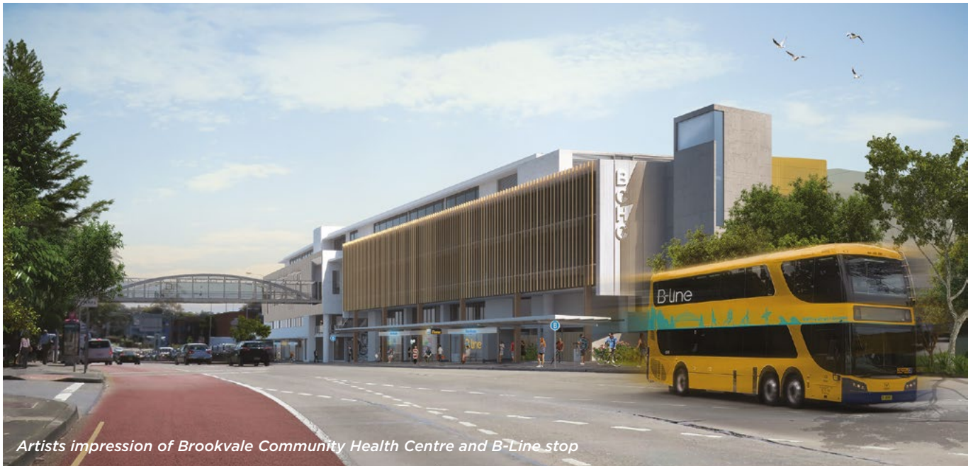
Artists impression of Brookvale Community Health Centre and B-Line stop