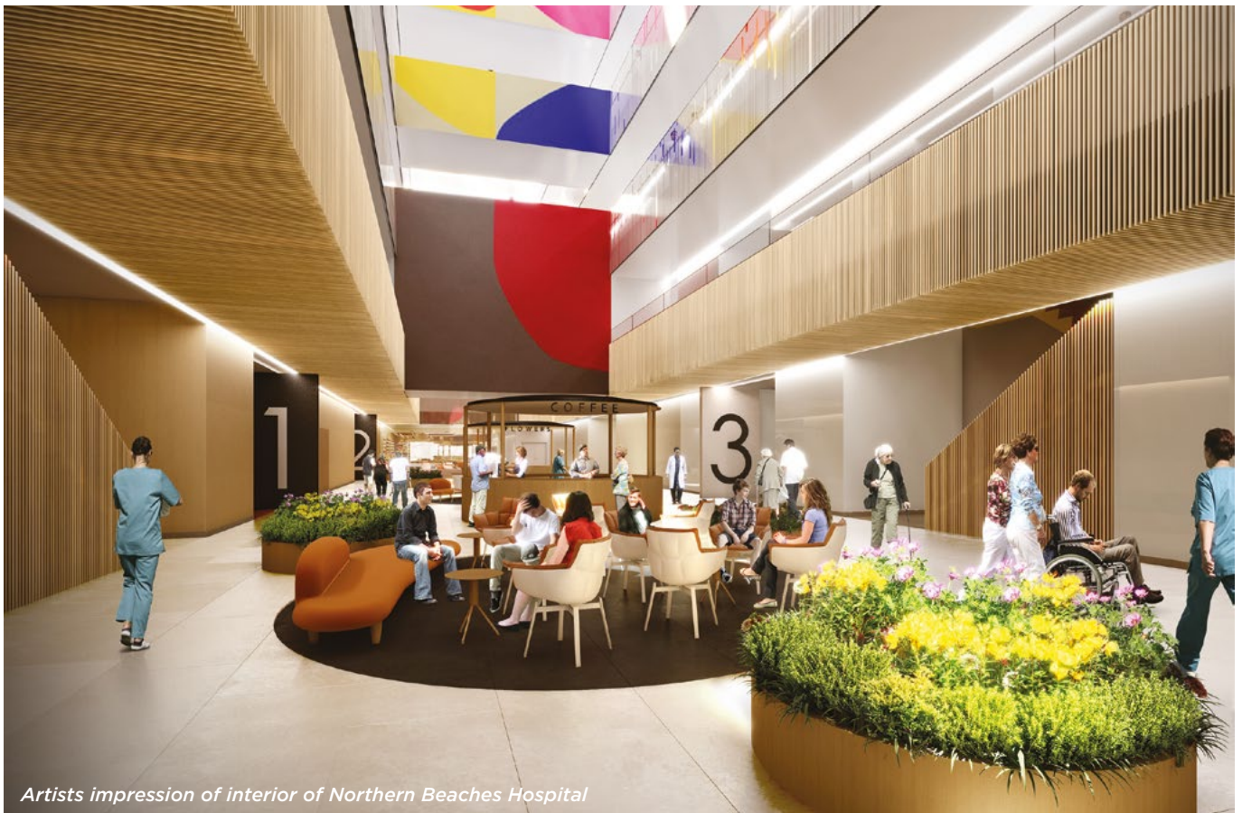
Artists impression of interior of Northern Beaches Hospital